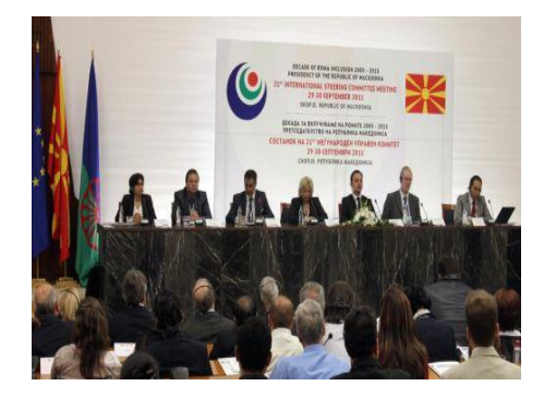
21-st International SteeringCommittee of the RomaDecade, September 29-30,2011

On this meeting, organized under the country's Presidency of the Decade, national coordinators submitted their reports for implementation of the action plans for Roma inclusion for 2011.