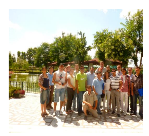
Participants in the training in Project Cycle Management, 19-21 July 2011, Skopje

In order to ensure timely provision of information about the activities planed and implemented within the project Support to the Implementation of the Roma Strategy, the project team uses various information approaches. This newsletter, to be issued every four months, is designed and published to contribute to this aim. This first issue describes the activities implemented during the period February - September 2011. From now on, this newsletter, together with other information on the project and a range of resource materials related to the Roma Strategy and Decade, and the Romani population in general, can be accessed on the project's web page on www.mtsp.gov.mk.