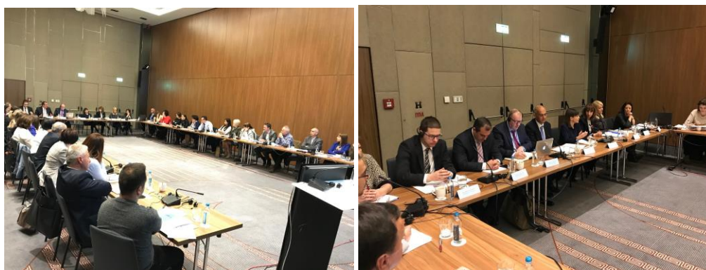
Figure 1 Photos from the Workshop "Registration to Social Insurance and Social Insurance Data Warehousing: International Experience and Options for North Macedonia", hotel Marriott - Skopje, March 28, 2019

On 28 March 2019, MLSP and WB had organized Workshop "Registration to Social Insurance and Social Insurance Data Warehousing: International Experience and Options for North Macedonia" for experience exchanging with experts from Serbia and Slovenia and providing information to the interagency working group tasked with designing the new system.